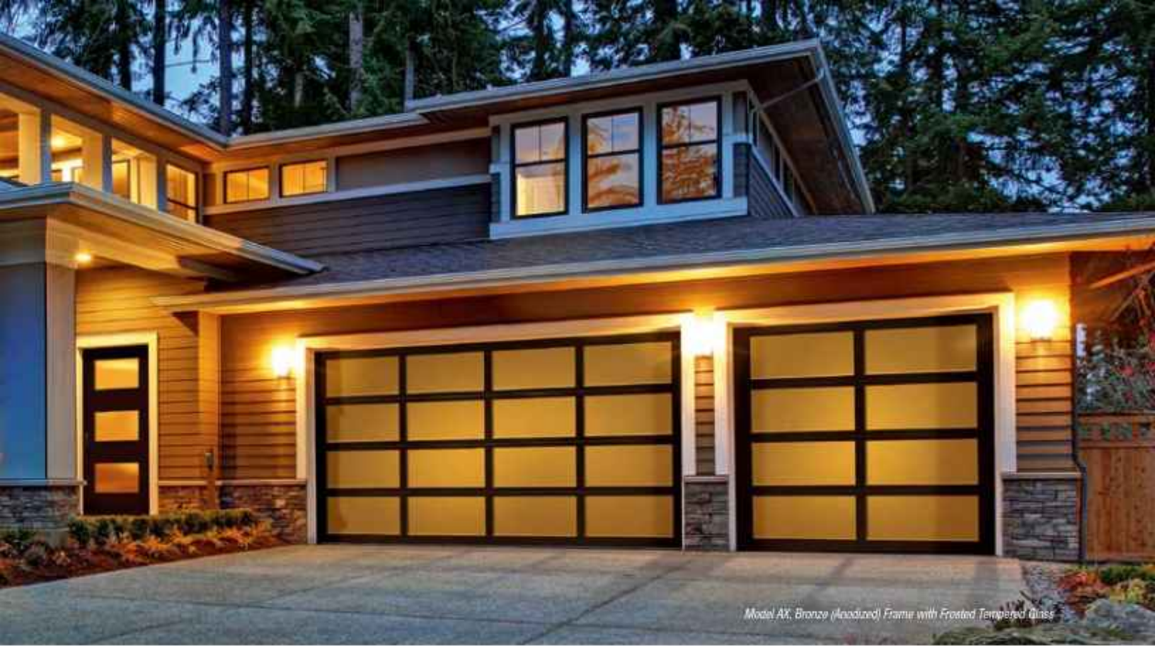
Model AX, Bronze (Anodized) Frame with Frosted Tempered Glass