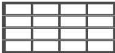
4 Panel 13'3" to 16'2" Wide