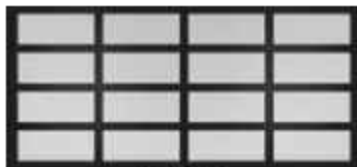
AX/AXU Double car door