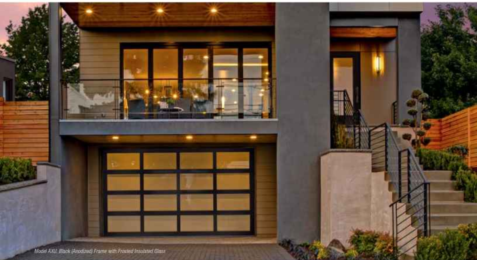
Model AXU, Black (Anodized) Frame with Frosted Insulated Glass