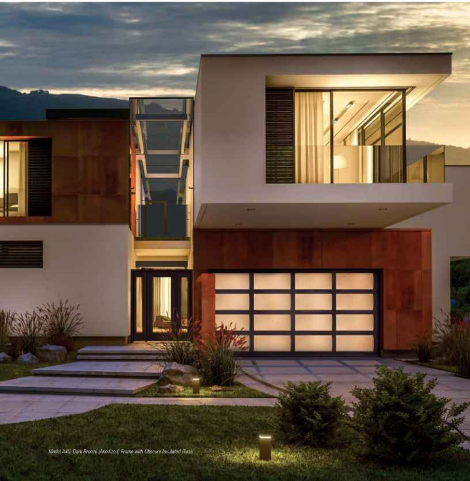
Model AXU, Dark Bronze (Anodized) Frame with Obscure Insulated Glass