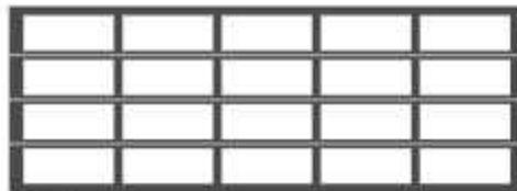
5 Panel 16'3" to 20'2" Wide