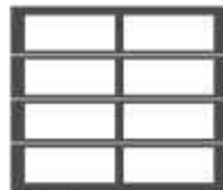
2 Panel Up to 9'2" Wide