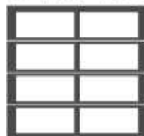
2 Panel Up to 9'2" Wide