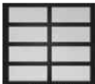
AX/AXU Single car door