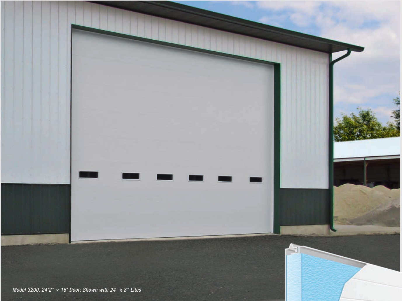
Model 3200, 24'2" x 16' Door; Shown with 24" x 8" Lites